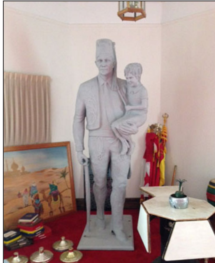
The Shriner statue and the various temple contents kept by the temple are safely stored in a room on the 6th floor of our temporary quarters in Grand Rapids. Our Friday Temple receptions are held in the same room every week.