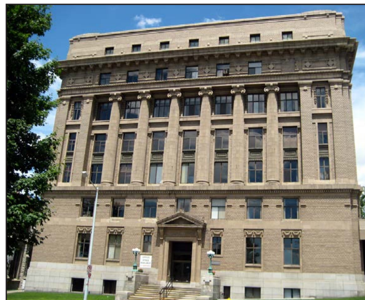
Saladin Shriners and Saladin Shriners Children's Trust are currently housed in temporary quarters in the Grand Rapids Masonic Temple at 233 East Fulton St. in Grand Rapids.