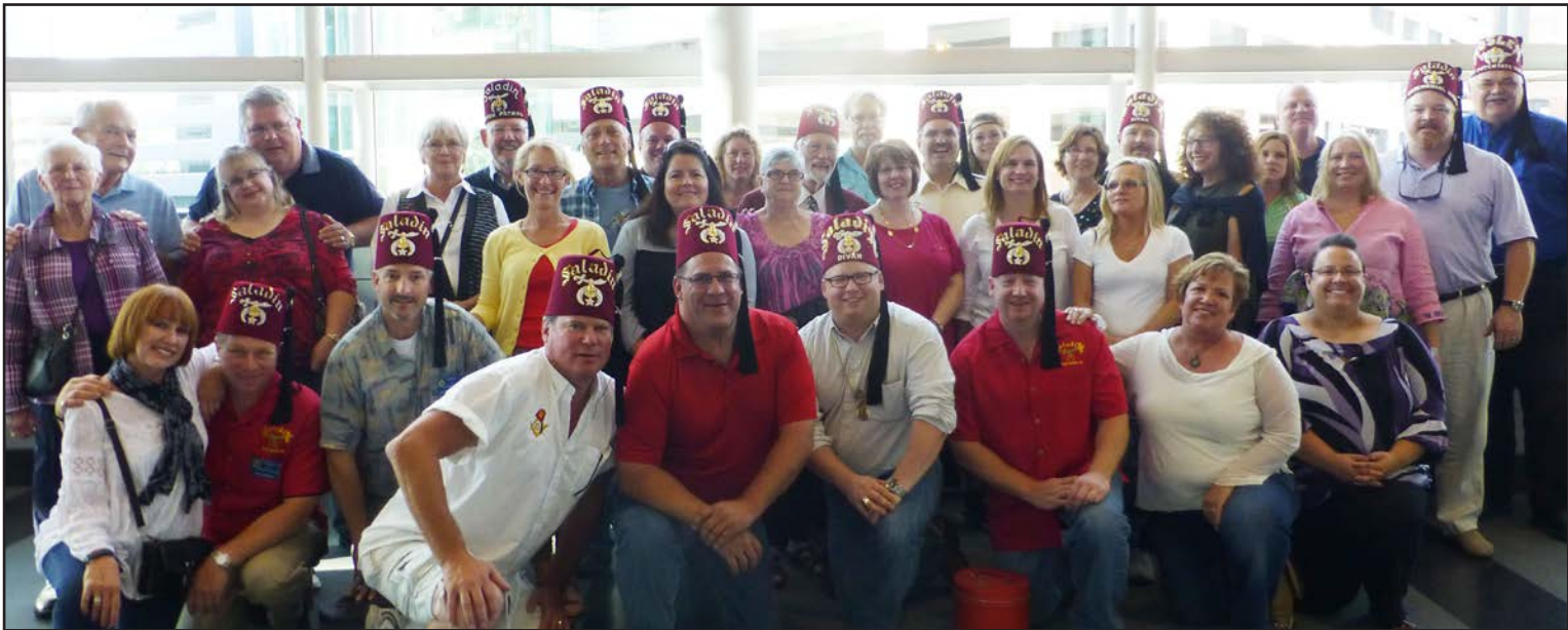
Several Saladin Shriners and Ladies turned out to support Shriners Hospitals for Children (SHC) by selling Eagles CDs before a recent Eagles concert at the Van Andel Arena in Grand Rapids. Everyone had a good time and raised $4,240 for our Hospitals. Our hardworking volunteers had the chance to watch the concert afterwards.