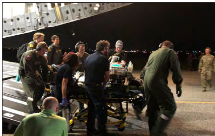
US Air Force Personnel, Local Galveston EMS, and Shriners Hospitals Staff rush a Burn Victim from military transport to a nearby ambulance for transport to Shriners Hospitals.