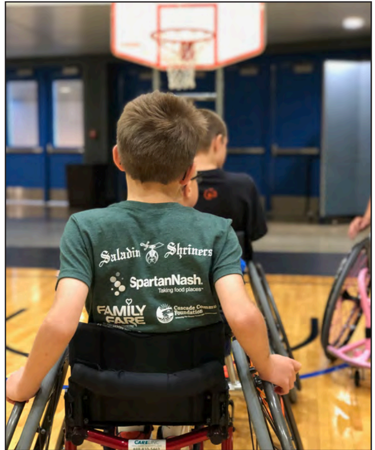
A Mary Free Bed Adaptive Sports Camp Participant displaying Saladin's sponsorship of this excellent program.