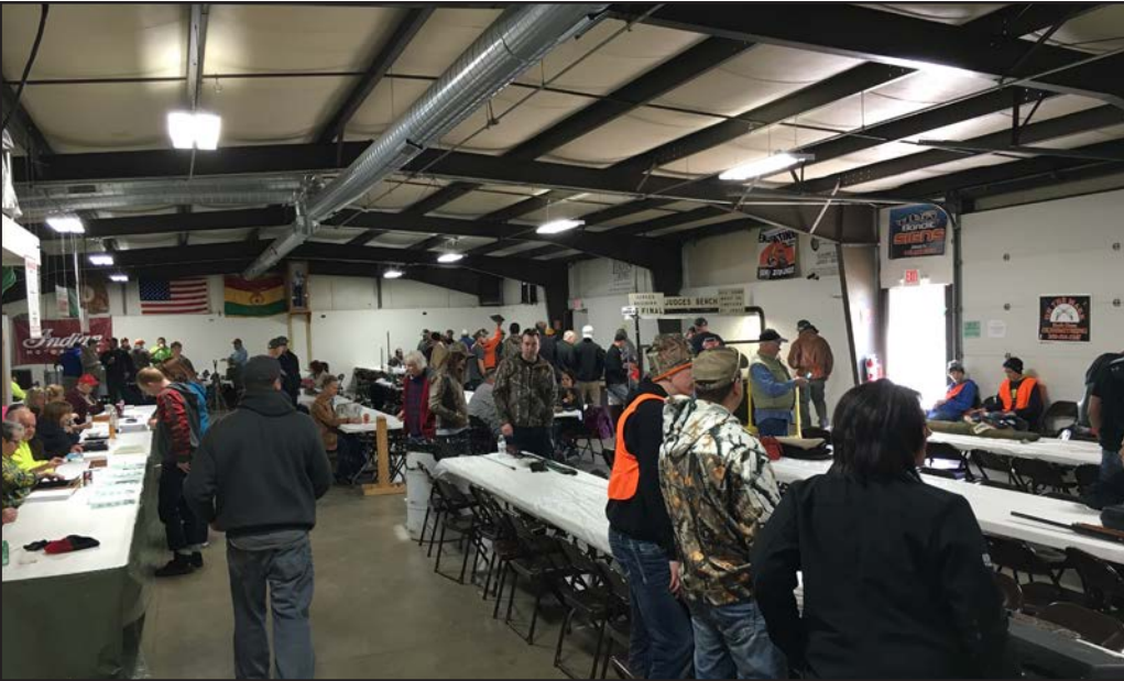
The Nobles of the Cass County Shrine Club hosted their Annual Spring Turkey Shoots two consecutive weekends in April. This highly successful fundraiser makes it possible for the club members to donate thousands of dollars each year to local charities and the Shriners Hospital for Children. The Fall turkey shoot will be held during the last two weekends in October.