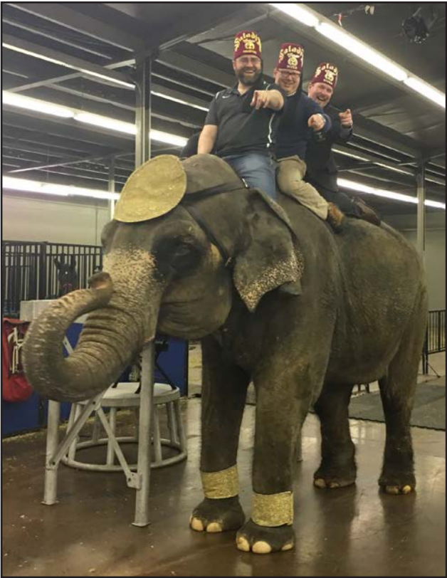
One thing we know for sure is that none of those guys have been getting any lighter. Vicki the elephant confirmed it. We had the opportunity to visit the trainers and animals to see how well these magnificent animals are cared for.

Got a Photo? Send it to us! Recorder@saladinshrine.com